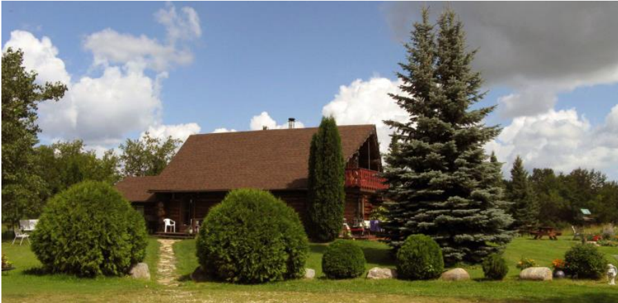
East Edge of Duck Mountain Provincial Park

Retreat Centre – 20 min North-West of Ethelbert MB.